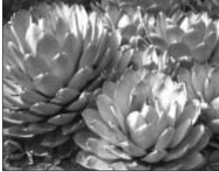
Agave parryi var. truncata