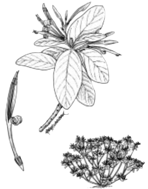
Justicia spicigera (Mexican honeysuckle)