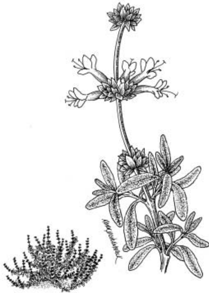
Salvia clevelandii (Chaparral sage)