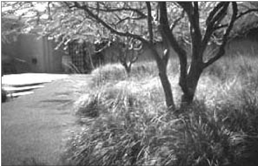
Muhlenbergia rigens (Deer grass)